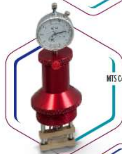
MTS Cell Head